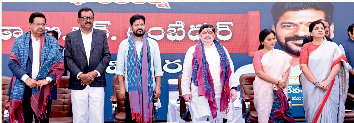
Hon'ble Chief Minister of Telangana, along with other distinguished dignitaries, unveiling the statue of Dr. B. R. Ambedkar at Dr. B. R. Ambedkar Open University, Hyderabad.

Hyderabad, 26th January 2025. The unveiling ceremony of the statue of Bharat Ratna Dr. B. R. Ambedkar was held with great reverence at Dr. B. R. Ambedkar Open University (BRAOU), Hyderabad. The momentous occasion was graced by the Hon'ble Chief Minister of Telangana as the Chief Guest, along with the Hon'ble Minister for Transport and BC Welfare.