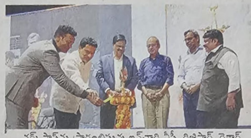
వర్క్ షాప్‌ను ప్రారంభిస్తున్న ఇన్-చార్జ్ వీసీ, రిజిస్ట్రార్, రెక్టర్ మని చెప్పారు.