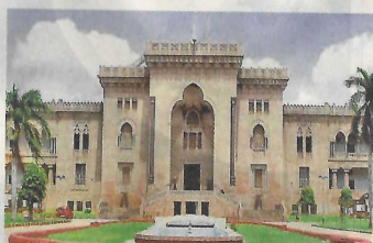
Osmania University has been operating with just 28 per cent regular faculty out of a sanctioned strength of 1,267 positions.

Further, the OU that had been established as the first