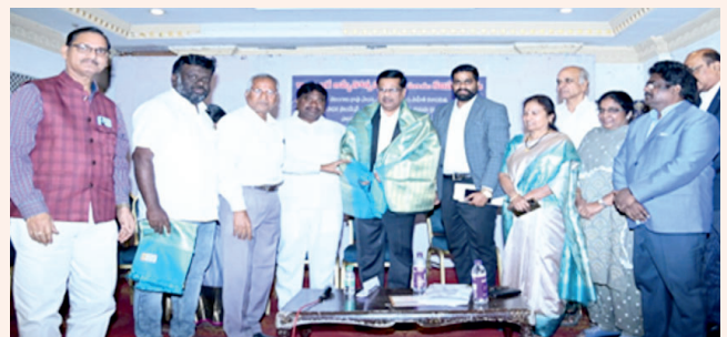
Telugu Basha Chaitanya Samithi at Ravindra Bharathi