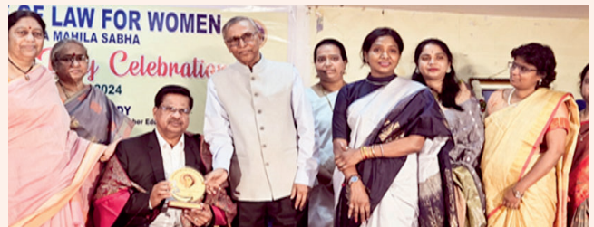
At College of Law for Women, Andhra Mahila Sabha

The session was well-received by educators, policymakers, and stakeholders, all of whom recognized the significance of Prof. Reddy's vision in shaping the future of Telangana's higher education landscape. The roadmap proposed by the Chairman not only aims to elevate the standards of education within the state but also seeks to make Telangana a prominent hub for academic excellence, innovation, and research in the country.